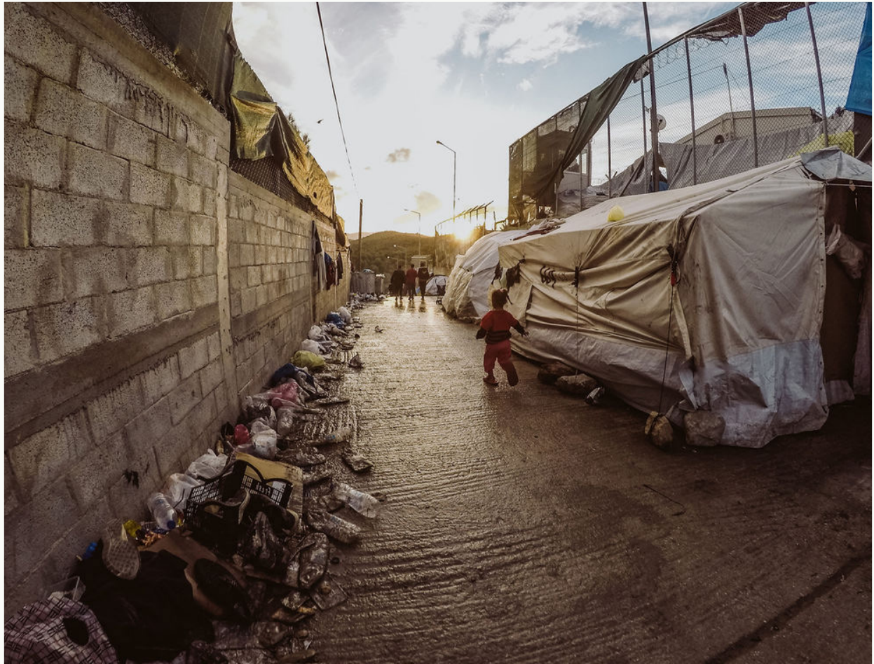
Refugee camp in Greece