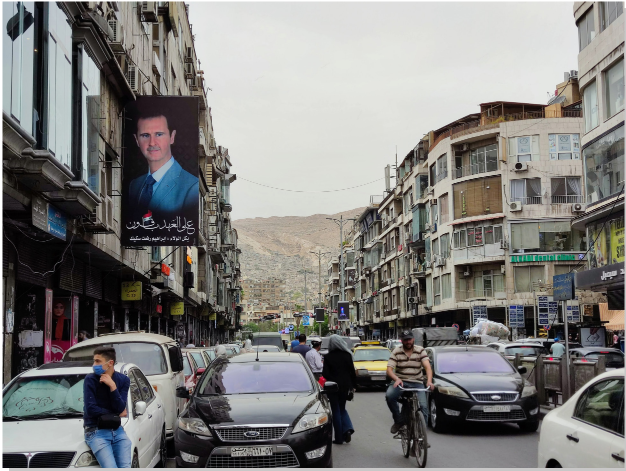
Photo of Assad during the election campaign on Hamra Street, Damascus; May 2021

opposition voices are silenced, and destructive forces remain. This report begins with an examination of the role Syrian law plays in people's ability to return to their lives in Syria. One such law, compulsory military service, is highlighted as both a driver of flight and a threat to those who face return to Syria. Based on interviews with families of those who have returned and have gone missing, the report discusses security risks that Syrians face on the ground.