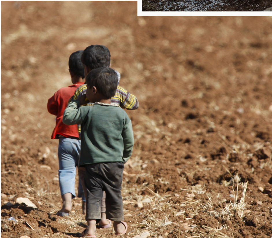
Top right: Refugee camp in Greece; Bottom left: Syrian refugees walking on Turkey-Syria border, 14 May 2014