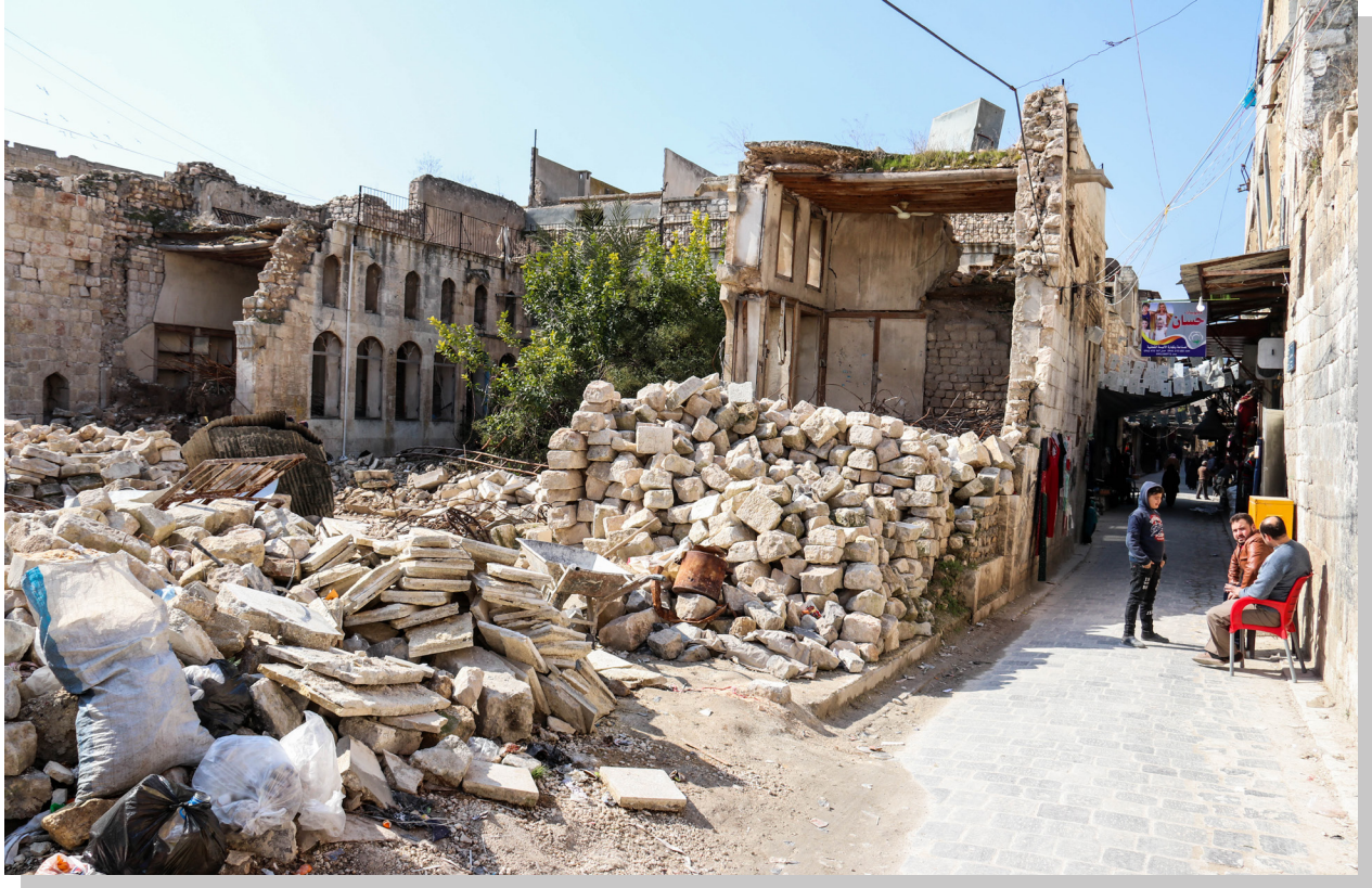
Aleppo after ISIS was defeated in November 2020