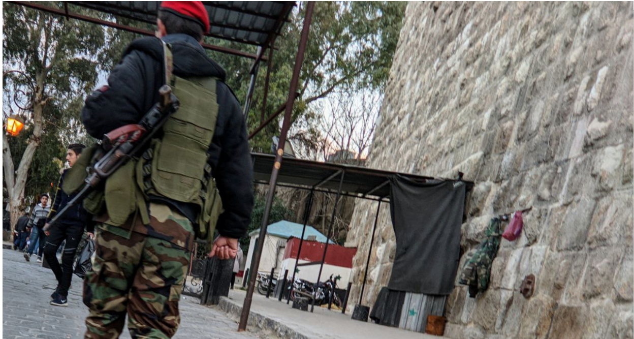
Security forces in Damascus

Among the millions of Syrians living outside of Syria are hundreds of thousands of young men who did not perform mandatory military service for fear of the certain dangers and possible death that conscription entails. Many are unwilling to be involved in human rights violations committed by the Syrian army like arbitrary detention, torture, indiscriminate bombings, and the use of chemical weapons. Most of these men cannot afford the exemption fee to avoid conscription (noted below), as many are living in dire economic conditions in the countries where they found asylum. 23