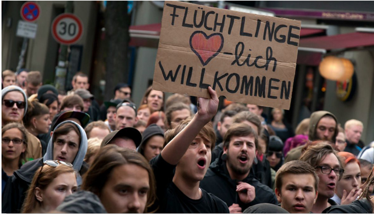
Refugees Welcome - Germany

neither of which is a signatory to the Refugee Convention or Protocol and both of which have contributed to forced returns to Syria. 30 Denying refugees the right to work limits their ability to legally contribute to the Jordanian and Lebanese economies, both of which are increasingly strained. 31 For refugees living in urban areas, denying work permits limits the likelihood that Syrian refugees will successfully integrate into host communities. Meanwhile, individuals residing in camps become more isolated and alienated. In Turkey, authorities continued to unlawfully deport Syrians to Idlib in violation of the non-refoulement principle. 32 Given that most deportees are adult males, families struggle to survive without their male breadwinners. They often have no other choice but to return to Syria where, at the very least, parents and children can reunite.