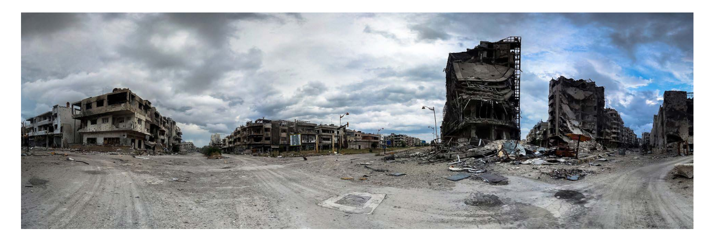
Al Cornish (Homs), 16 May 2013 Destruction on Mimas Street in Al Cornish.

the fact that the program was imperfect – containing several crippling flaws early on – makes Bosnia a useful case study when examining potential challenges presented by a post-conflict restitution initiative. In Bosnia, the international community also had unprecedented influence in the creation and implementation of the program, and several of its actions throughout the return period were integral to its ultimate success. The international community is likely to play an important role in return and restitution in Syria, so Bosnia offers valuable insights into the way external actors can assist or hinder a future process.