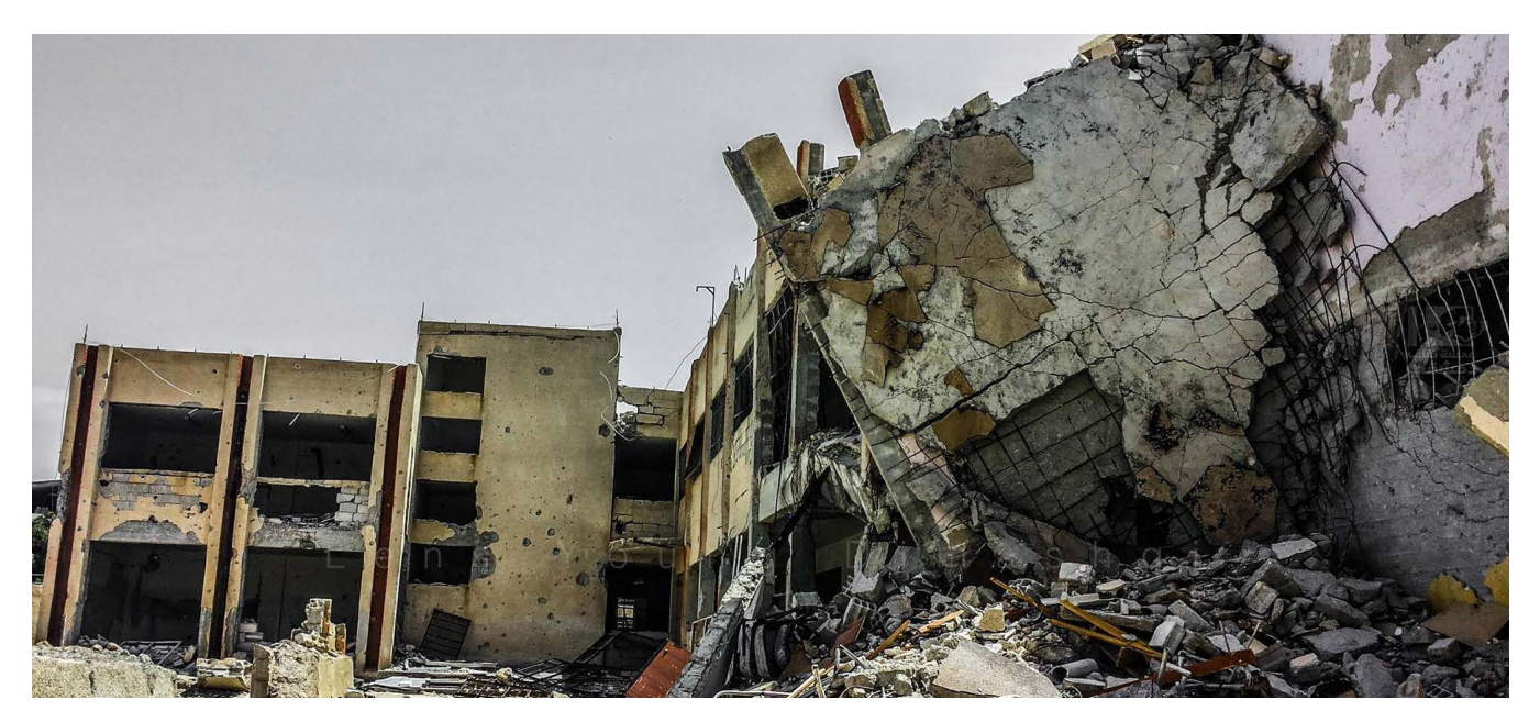
Yabroud (Damascus), 6 August 2014 Destruction caused by the shelling on Yabroud by the regime.

It is highly likely that fraudulent transactions will be followed by transactions done in good faith, which will result in future disputes about who is legally entitled to the property. Such disputes could exacerbate the difficulties surrounding property restitution.<sup>95</sup> Even if certain home owners were to possess proof of property, the (often intentional) destruction of property records and forced evacuations have left many Syrians bereft of proper evidence. Knowing this all too well, Syrians are often unwilling to leave behind their property for fear of losing it at the hands of looters or forgers, sometimes at risk to their own lives.<sup>96</sup>